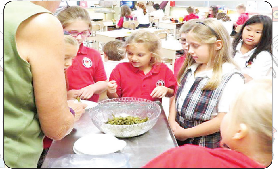
SOUTHAVEN – Sacred Heart second-graders sample beans they planted during the last school year.

During Advent, students gather in an assembly every Friday and sing the Advent song; Each year for Catholic Schools week, the entire school and student's families parade to City Hall to meet with the Mayor of Meridian who gives an official Proclamation of Catholic Schools week.