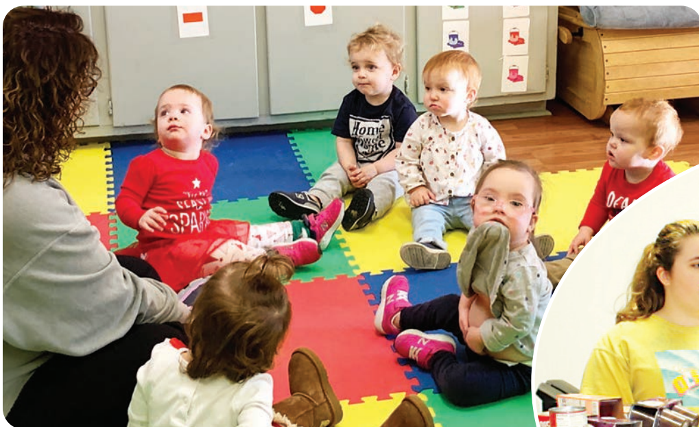
FLOWOOD – The “Creepers” at St. Paul Early Learning Center love story time.