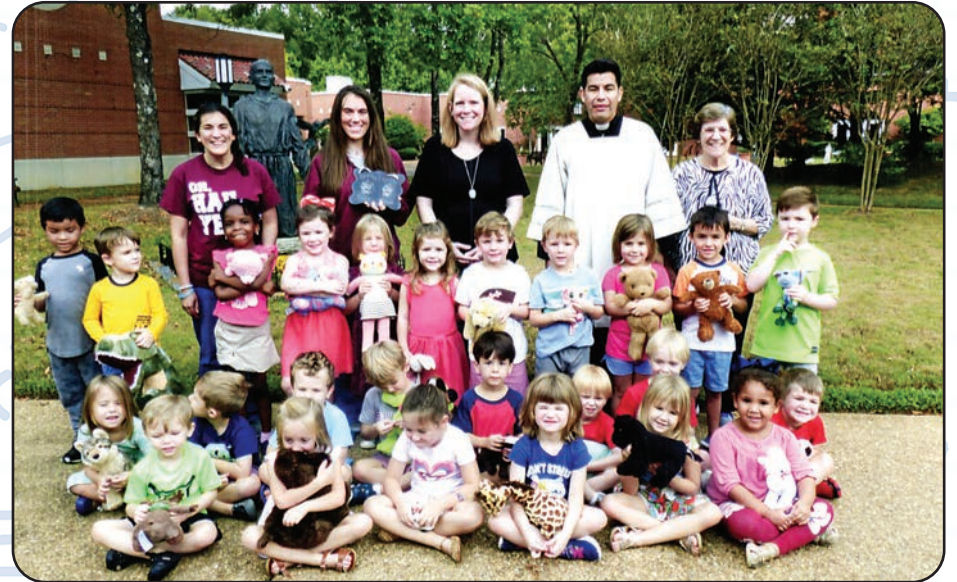
MADISON – Assisi Early Learning Center students pose for a photo after receiving a blessing for their stuffed animal "pets."

The school hosts an annual St. Vincent De Paul coat drive and canned food drive and angel tree.