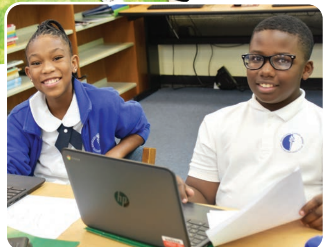
HOLY SPRINGS – Students at Holy Family school live the motto: "We embrace technology!"