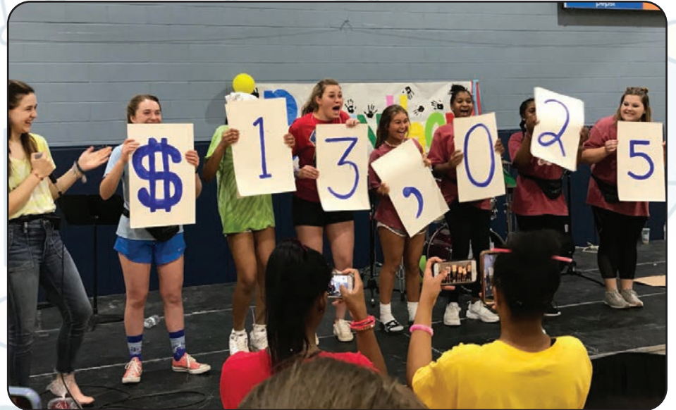
MADISON – St. Joseph students display the total raised at the eight hour Bruinthon fund raising event.