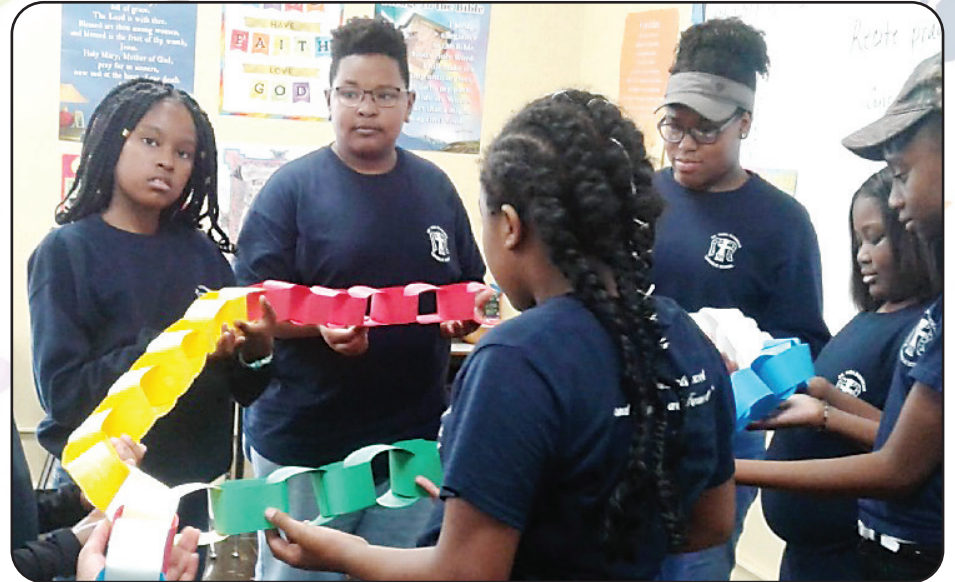
JACKSON – Fifth and sixth-grade religion students at Sister Thea Bowman school reflect on their completed class rosary project. Students worked to design a large colored coded rosary to help explain parts of the prayer.

BINGO and Hamburger Supper Night is a long-standing tradition during Catholic Schools Week. School and parish families come together for a night of food, fellowship, games and prizes to celebrate OUR catholic school!