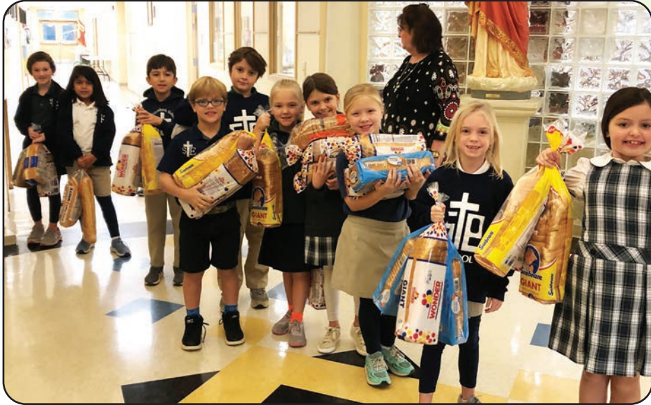
CLARKSDALE – Second-grade students carry loaves of bread to Mass in honor of St. Elizabeth of Hungary’s feast day. The bread is donated to The Care Station, a local soup kitchen and food pantry.

“I love SES! It feels like home and family. I’m an SES alum and feel honored to be teaching here. I love seeing growth in each child over the school year.”