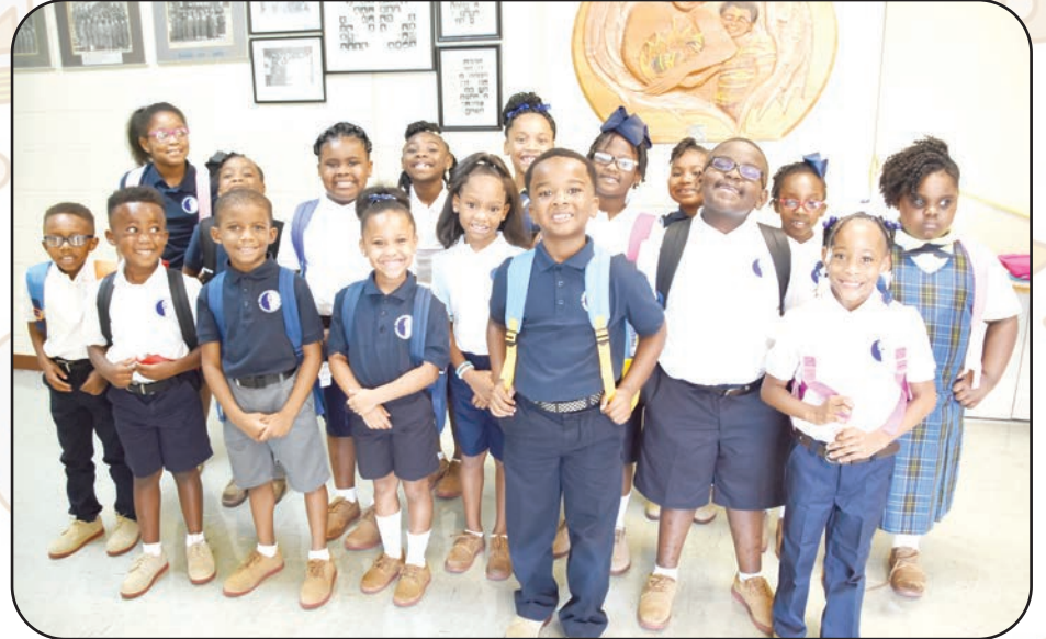
HOLLY SPRINGS – Students at Holy Family pose for a picture before they start their school day.