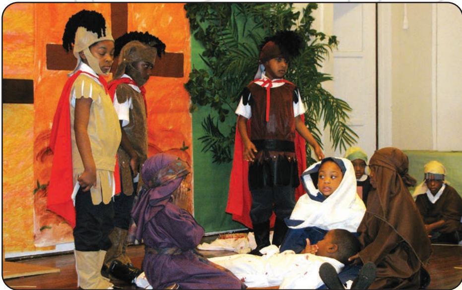
NATCHEZ – The passion play at Holy Family is a Lenten tradition. The students act out the entire passion of Christ, based on the gospels, including the resurrection.

"Children at Holy Family Early Learning Center continually amaze me with their capacity for learning, happiness and growth."